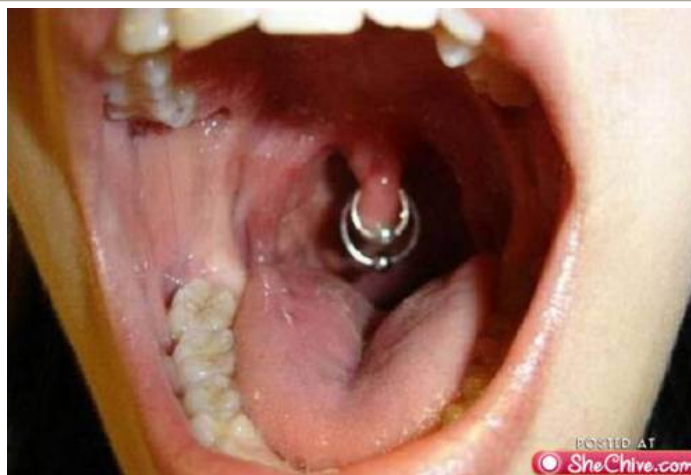
Doesn't food get stuck in there?

Two men work in a mortuary. One says to another, "You should see that woman they brought in today. She'd been in the water for a week. Her clit was like a pickle." "Ew!" says the other fellow. "It was green?" "No, it was sour!"