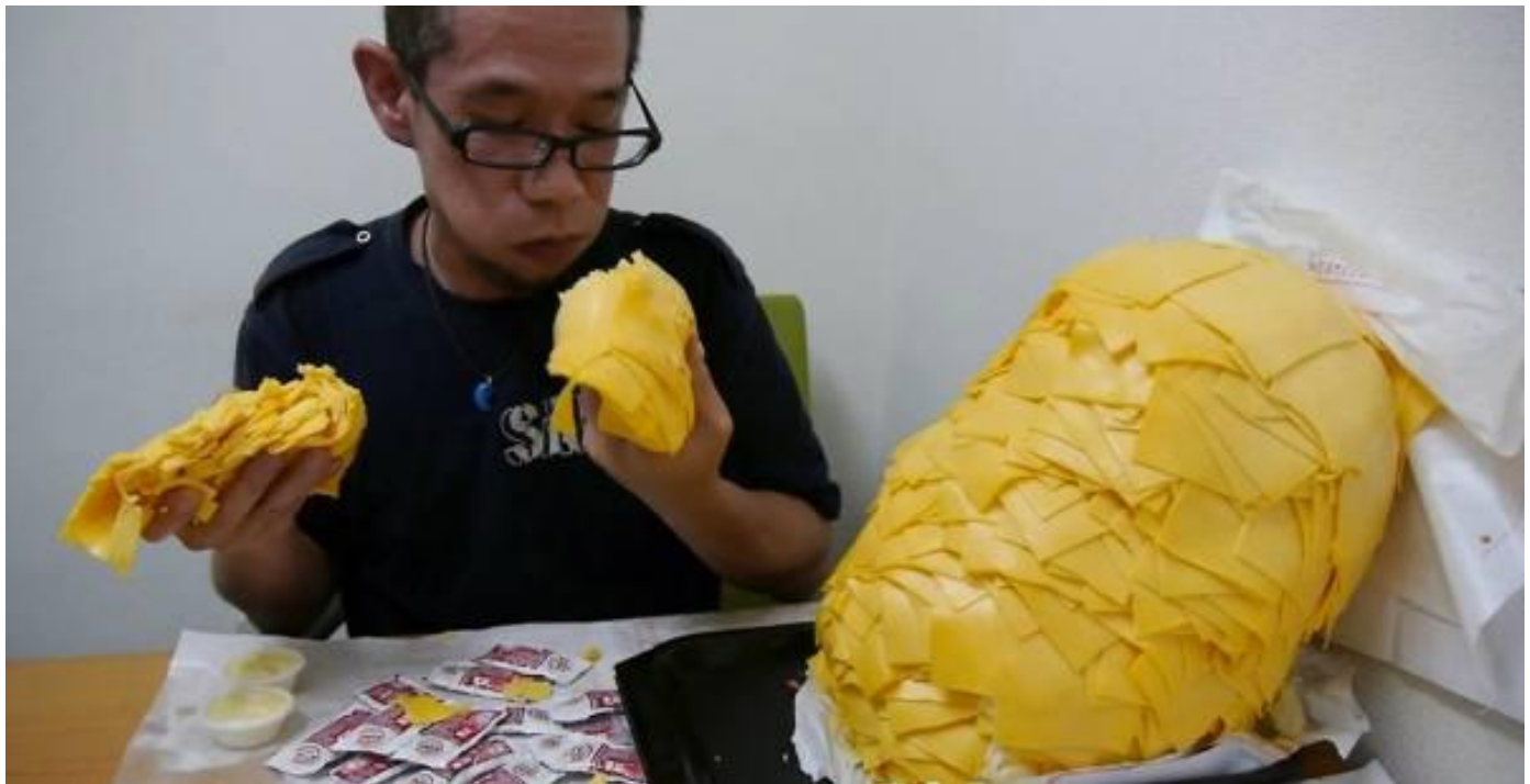
Got enough cheese?