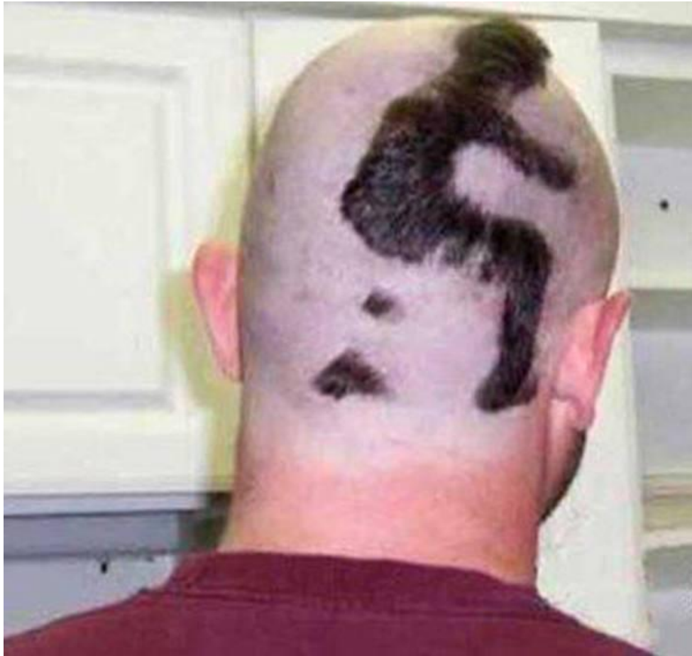
A bad haircut made worse.